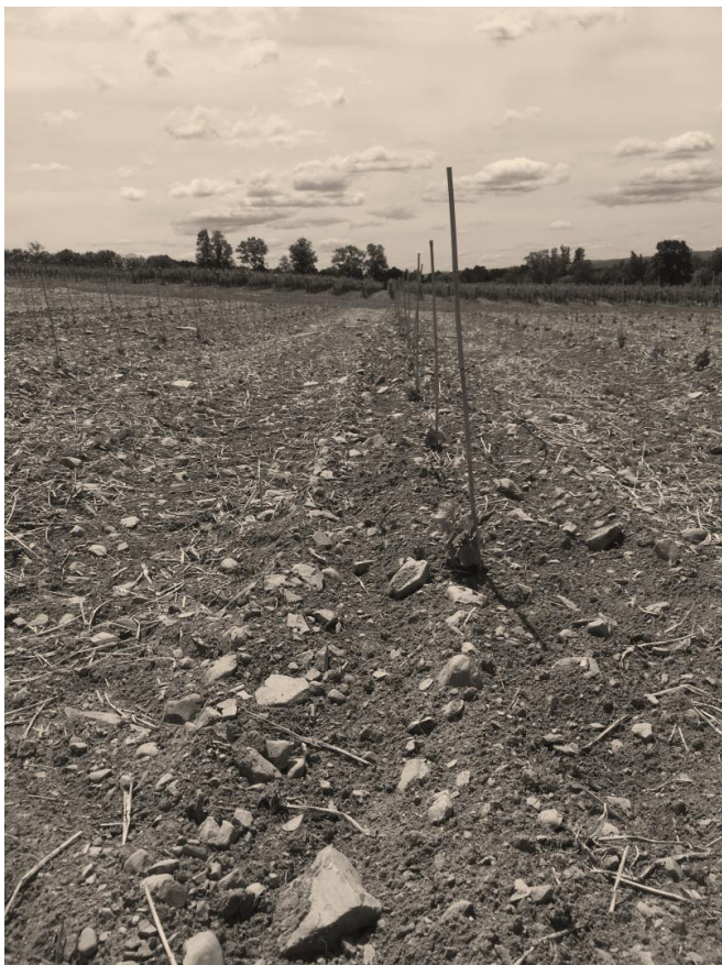
Cabernet Franc - July 2/2016